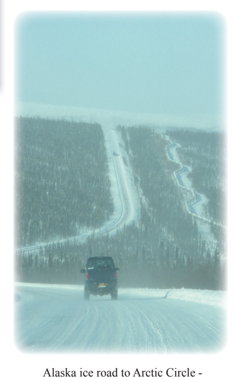
Arctic pipeline on right