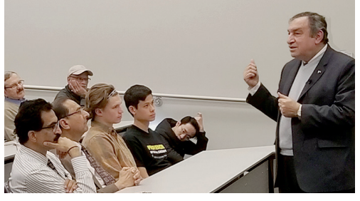
Essam Sharaf, former Prime Minister of Egypt and Lyles School of Civil Engineering alumnus, discussed how his education and career in engineering served him in public office.

In spring 2019, the Lyles School was pleased to host Essam Sharaf, PhD, former prime minister of Egypt