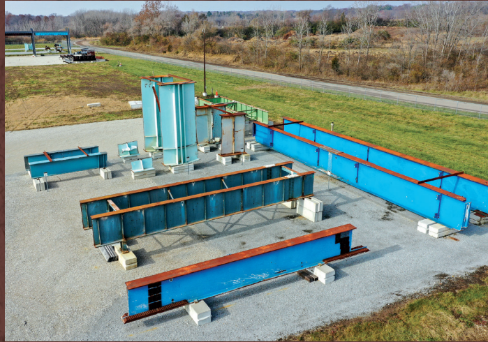
Steel bridge components on display at the 22-acre Center for Aging Infrastructure.

"We drive around the area, get LiDAR data and process it — which gives us the 3D point cloud," she says. "And from that, we can extract different features or different traits of the infrastructure."