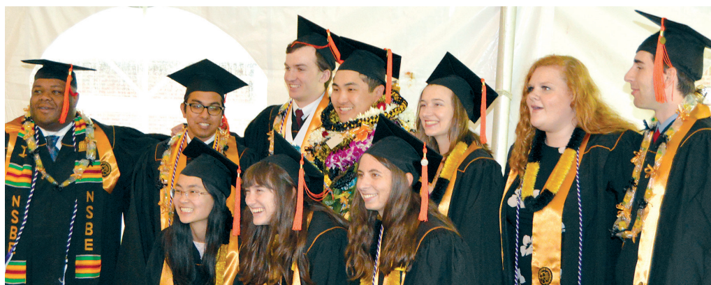
This spring, about 150 undergraduate and graduate students earned degrees from the Lyles School of Civil Engineering.